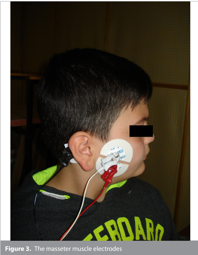
Figure 3. The masseter muscle electrodes